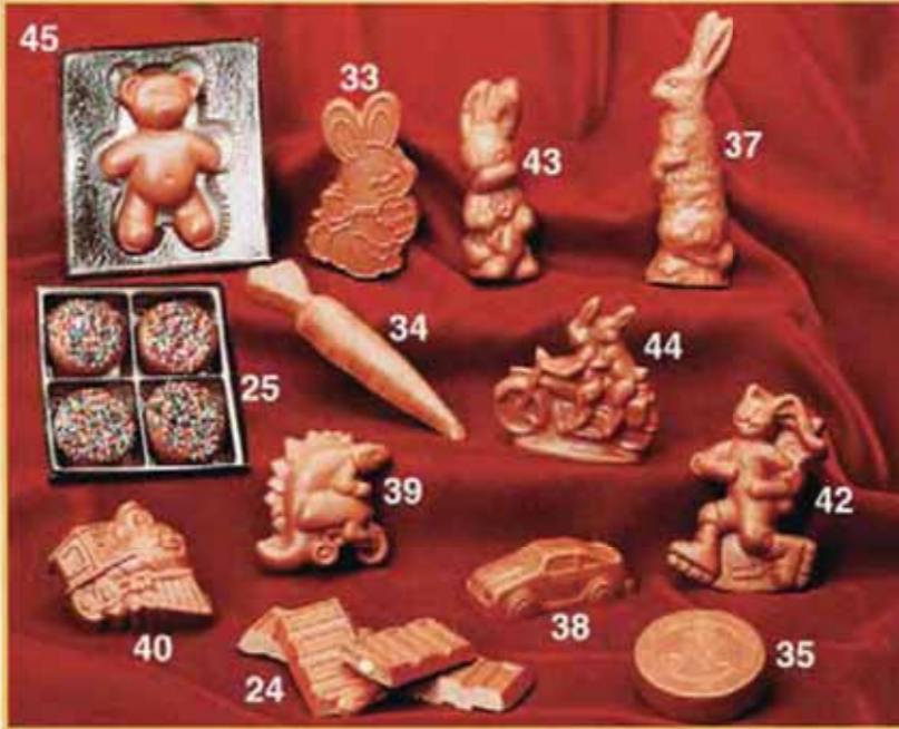
The most lovable characters your kids adore recreated in the very best milk chocolate.