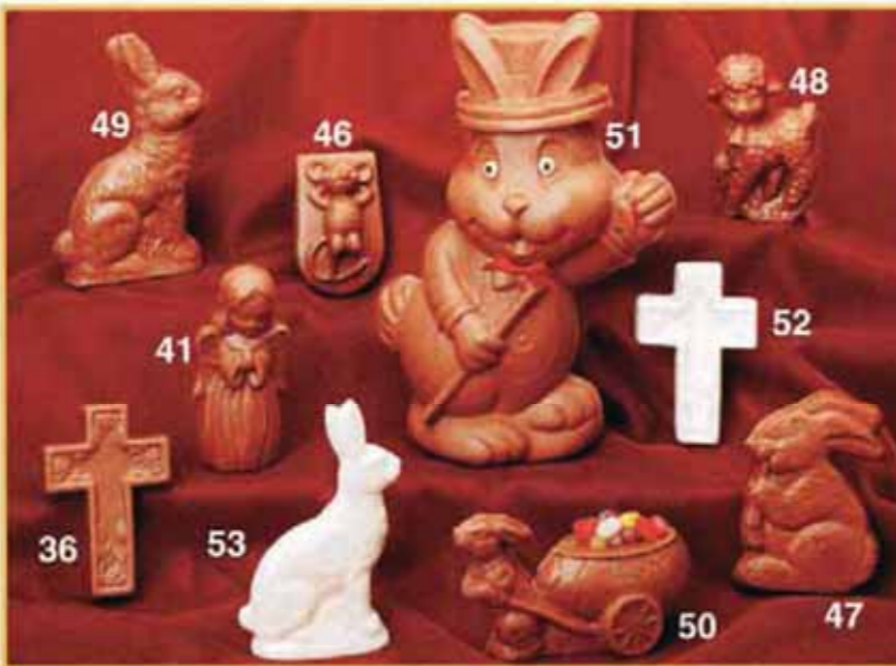
Delight your precious little bunny's taste buds with our charming milk chocolate bunnies and novelties.