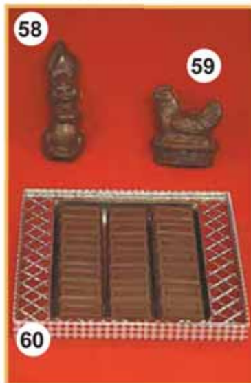
DARK CHOCOLATE - Cocoa rich, higher in antioxidants.